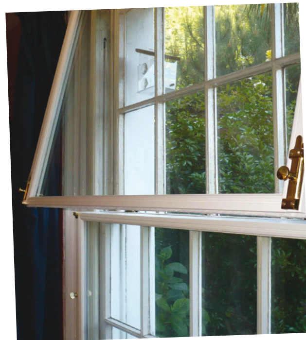
Double glazed secondary glazing to sash windows

The next step was to install a high efficiency gas combi boiler, designed to take a hot water feed from solar panels, should these be fitted in the future. As it is a listed building the panels could only be installed on the rear, west facing roof but this is not the ideal orientation. There is no obvious place to put a hot water storage tank but given that a boiler can last 15 years or longer, the family did not want to rule out the option of solar water heating in future.