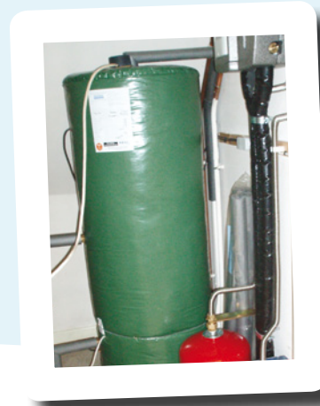
Well insulated cylinder connected to solar thermal and boiler

Next the owners addressed the replacement of the 25-year-old boiler. Several options were investigated as an alternative to gas central heating. A combined heat and power (CHP) system, air and ground source heat pumps were considered, but space, cost and savings considerations indicated an efficient gas condensing boiler as the best choice. Aquagas were commissioned to power-flush the system and fit a new A-rated boiler for around £2,000.