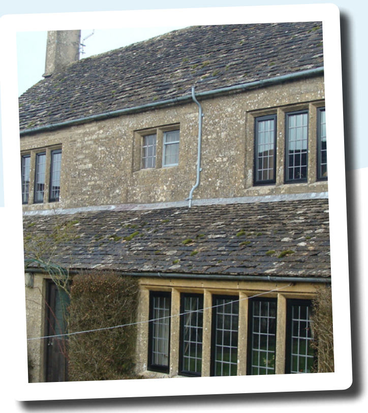
New double glazed windows at rear of property

and reinstatement of skirting boards, picture rails and lighting amounted to just over £9,500. The improvements should now help to keep this room warmer, and make it a habitable area in the winter.