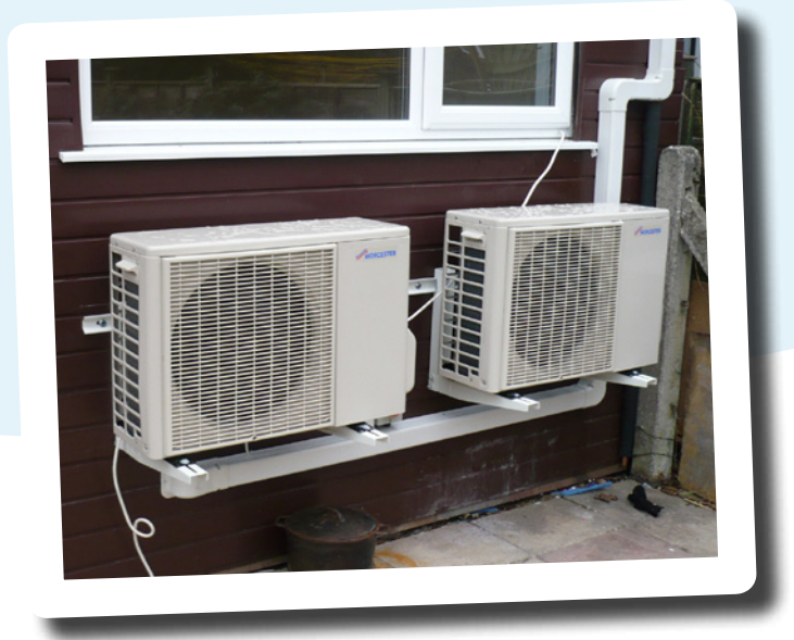
The two air source heat pump units mounted on back wall of house